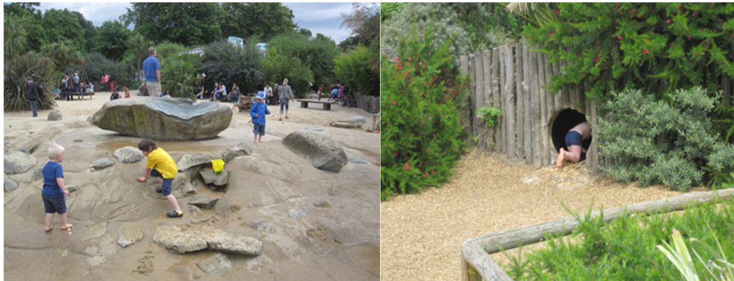
Picture 6: an excellent example taken from PlaygroundadventureUK of the Princess Diana Memorial Gardens in London