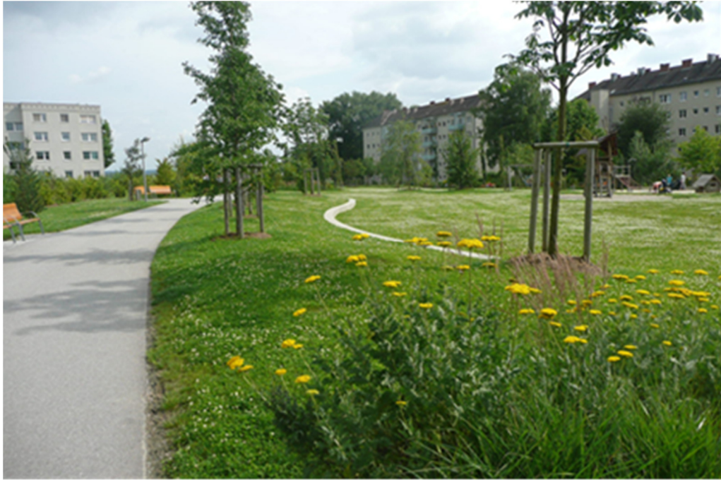
Picture 2: Wildflower planting on Amenity greenspace in Sompting, Brighton and Lewes Downs Biosphere