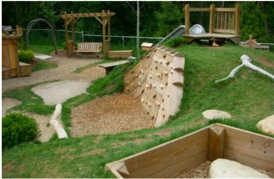
Picture 8 Adventure play taken from Islington Play Association